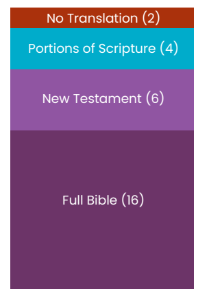
Spoken Languages with Believers in Guatemala

This leaves some communities without God's Word in their heart language. Expanding Bible translation efforts is vital to ensuring that every Guatemalan believer can read and understand Scripture in their native tongue.