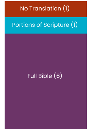
Spoken Languages with Believers in Djibouti

This gap in access continues to isolate entire communities from experiencing the Bible in their heart language, a crucial barrier to both evangelism and personal spiritual growth. But only one more translation is needed!