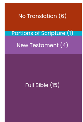
Spoken Languages with Believers in Brunei

For believers in these communities lacking translations, the Word of God remains inaccessible in the language of their hearts—a gap that urgently needs to be addressed through translation support.